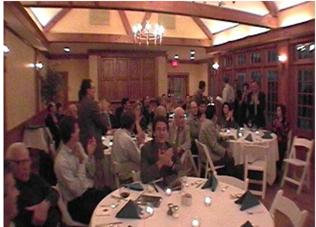
Reception in the Club Dining Room.