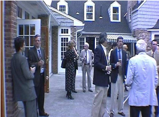
NNJSRA Members enjoying the reception on the patio at the Short Hills Club.