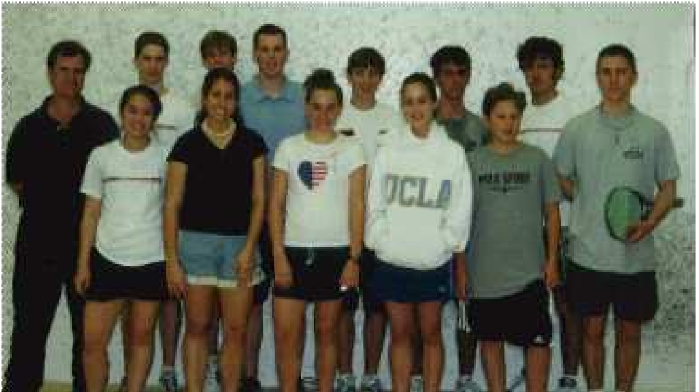
Members of The Chatham Club Junior Squash Team

Kids' Café is a program of America's Second Harvest, and is the nation's largest after-school meal service, providing free and prepared food and nutrition education to hungry children. Additionally, Kids' Café works with agencies and organizations to provide after-school tutoring, recreation and educational opportunities in a safe environment.